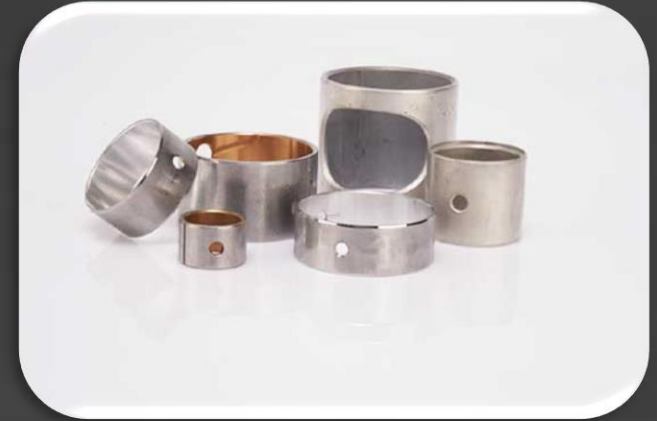
PPB & CSB