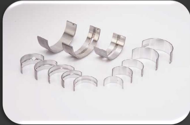
MB & CRB Bearings